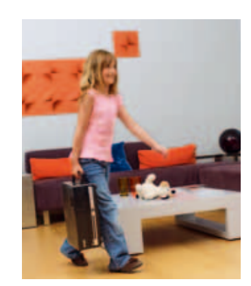
Lightweight and easy to carry anywhere